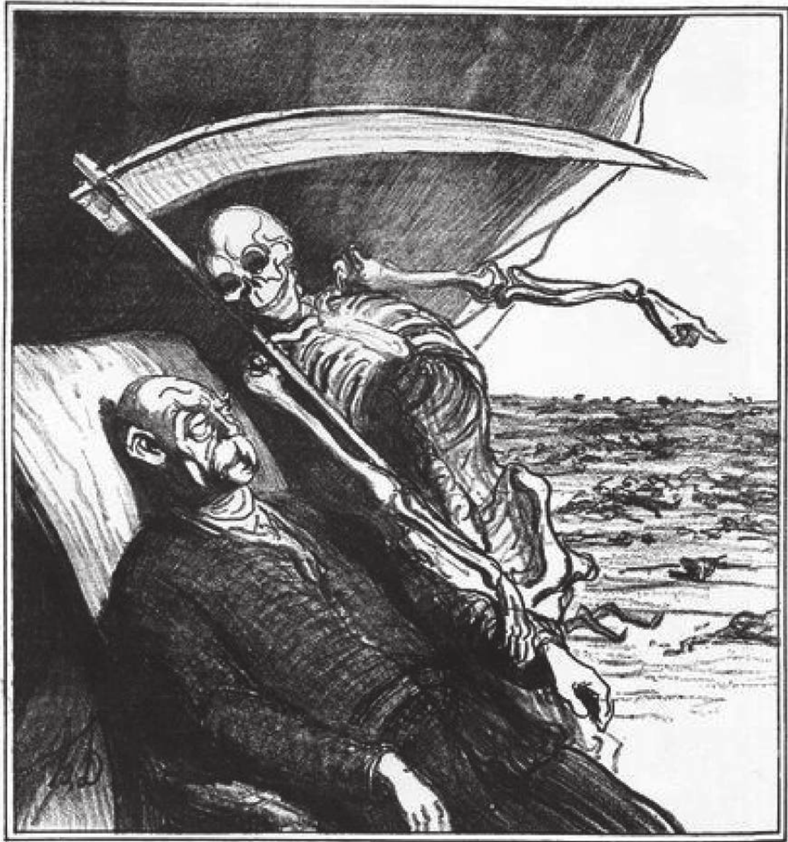
A cartoon published in France in August 1870 showing the war dead. The title of the cartoon is 'News'. The caption under the cartoon said, 'Bismarck's nightmare.' The Grim Reaper is saying, 'Thank you!...'