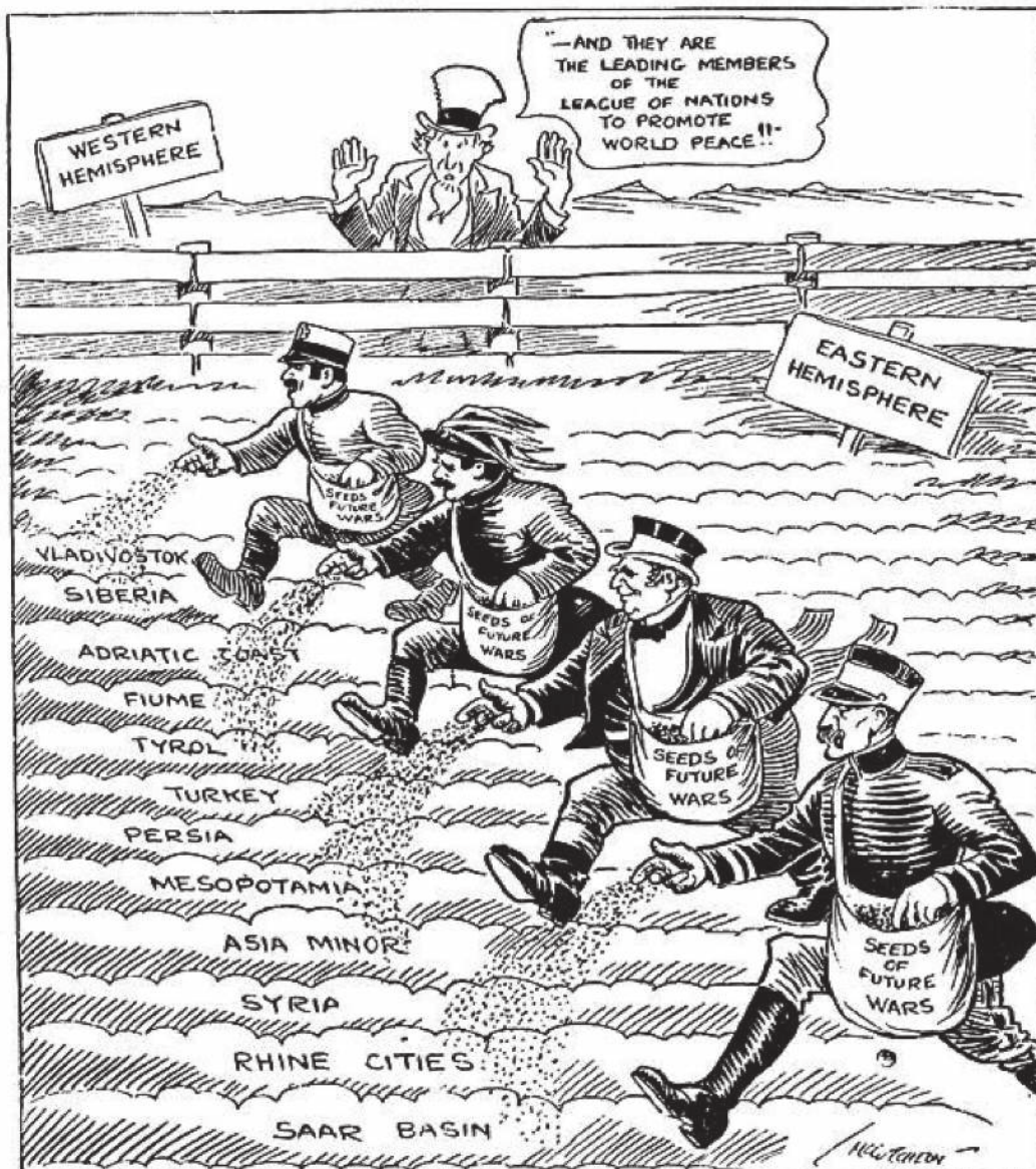
An American cartoon, 1920.